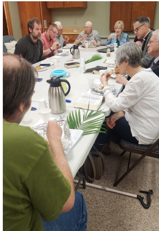
The Adult Bible Study participants made empty tomb buns on Palm Sunday, in anticipation of Easter Sunday. They turned out pretty well!