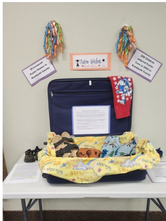
The Christian Education Youth and Families Committee, along with the entire church, is collecting clothing and monetary donations for Foster Stitches. This is a program provided under The Link in New London. This service provides clothing to foster families.