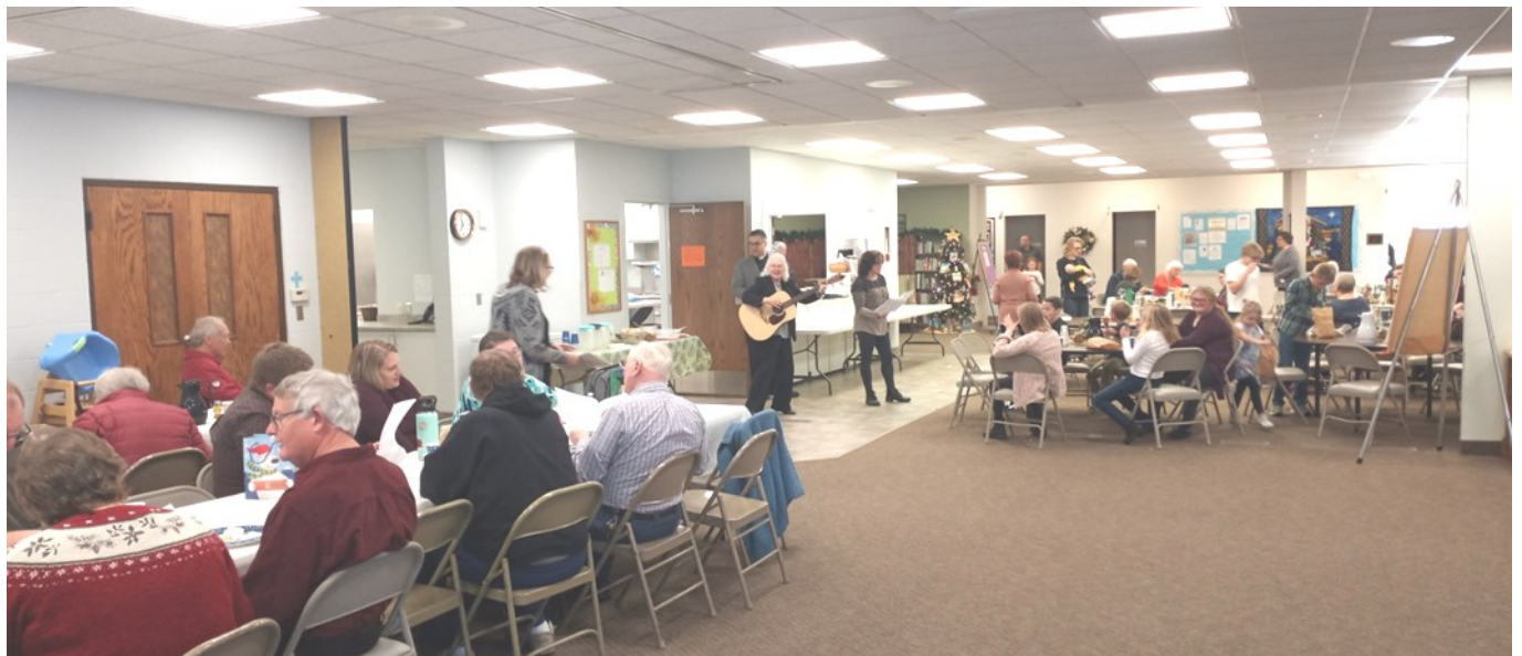
Advent Fun Hour