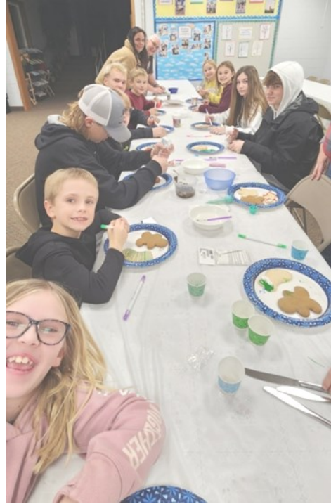
Decorating cookies to give away