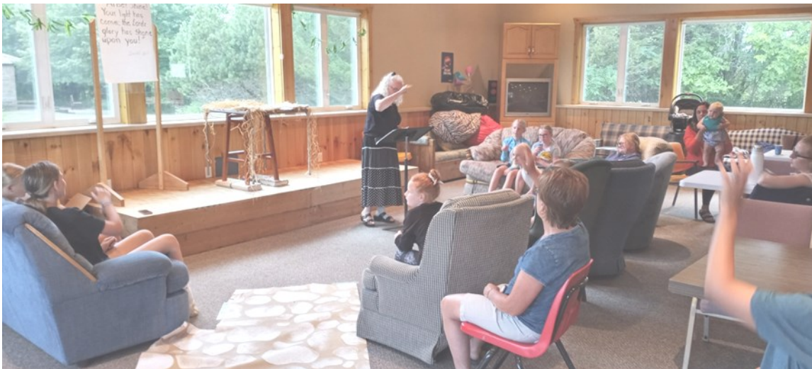
July Family Fun Festival "Faith Through the Roof"