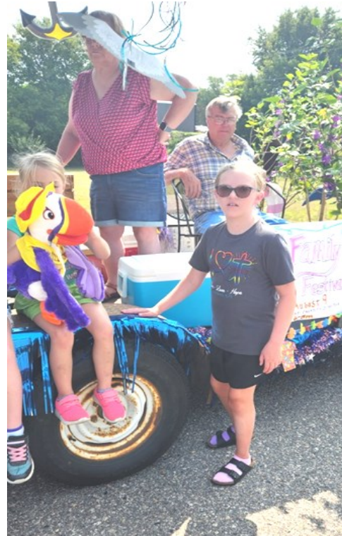
Fun Under the "SON" in the Spicer 4 th of July Parade and the New London Water Days Parade!