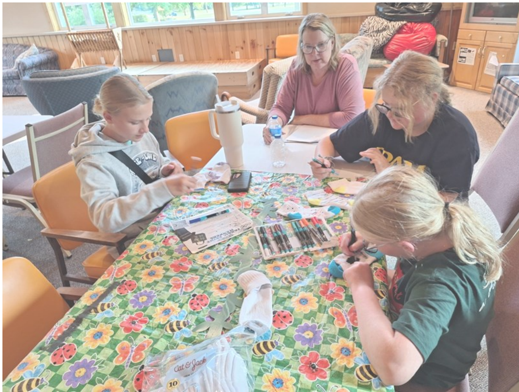
August Family Fun Festival- The "Lost" Parables